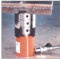
Cribbing blocks are shown in a 30 ton RSS302 "Shorty" cylinder. For more information see pg 38.