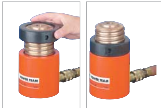
Locking collar feature permits non-hydraulic support of load.