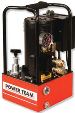
PE30TWP Torque Wrench Applications See page 172